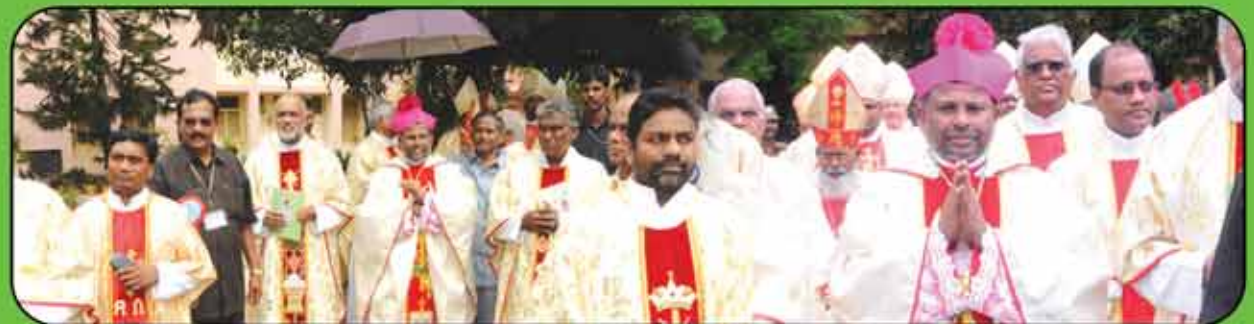
Episcopal Vicars, accompanying His Lordship for the Episcopal Ordination