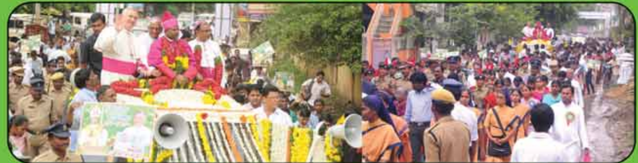
A grand welcome to the dignitaries through Xavier Nagar streets at 9.15 a.m.